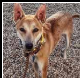
Milena - 2 Year Old Female Mixed Breed