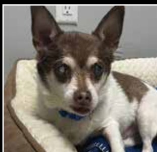
Tuby - 14 Year Old Male Chihuahua

631.593.1771 • 1430 Montauk Highway, Oakdale