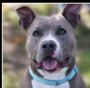
Hippo - 3 Year Old Female Pit Mix