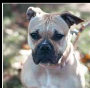
Gigi - 2 Year Old Female Pit Mix